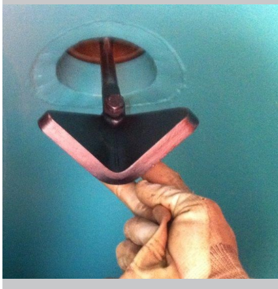
Fish Friendly profile siphon paddle