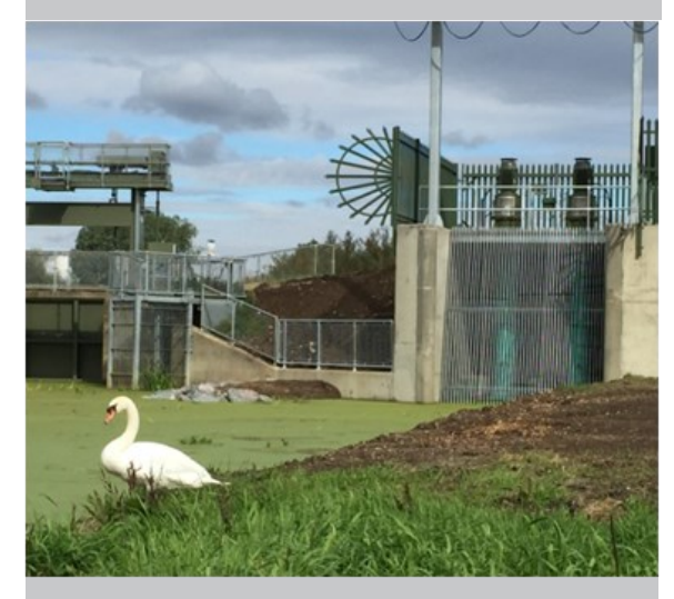
Webbs Hole pumping station