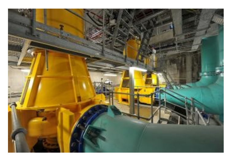
Bedford Pumps' Storm Pumps for Belfast WTW