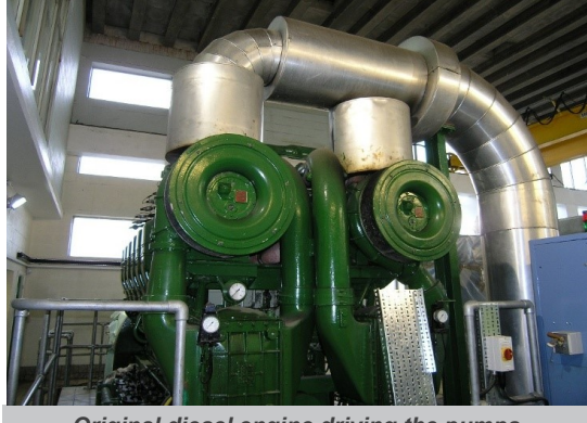
Original diesel engine driving the pumps