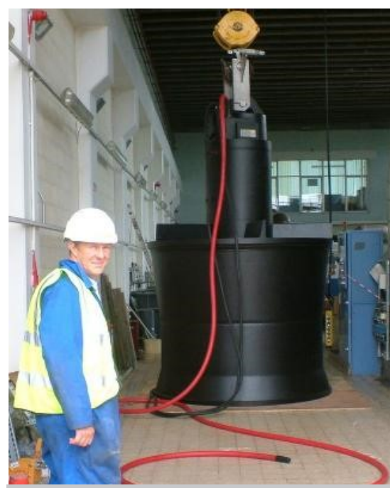
Bedford Pumps' Storm Pump for Altmouth P.S.

A number of different pumping configurations were considered during the outline design stage including replacing the existing Vickers pumps with three Storm Pumps operating at 15m3/s each at approximately 4.7m head. Bedford Pumps made a significant contribution to the station design by suggesting, and going on to supply, four pumps instead of the three, thus reducing the total head from 4.7m to 4m and subsequently saving 600kW on the installed power. The addition of a fourth pump would reduce the required flow per pump to 11.25m3/s.