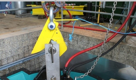
Unique latchlift system